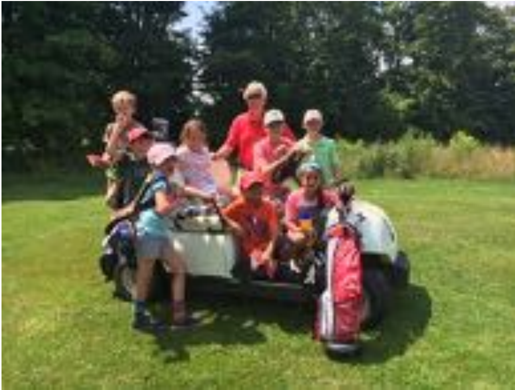
Golf Campers - the future of MVCC!